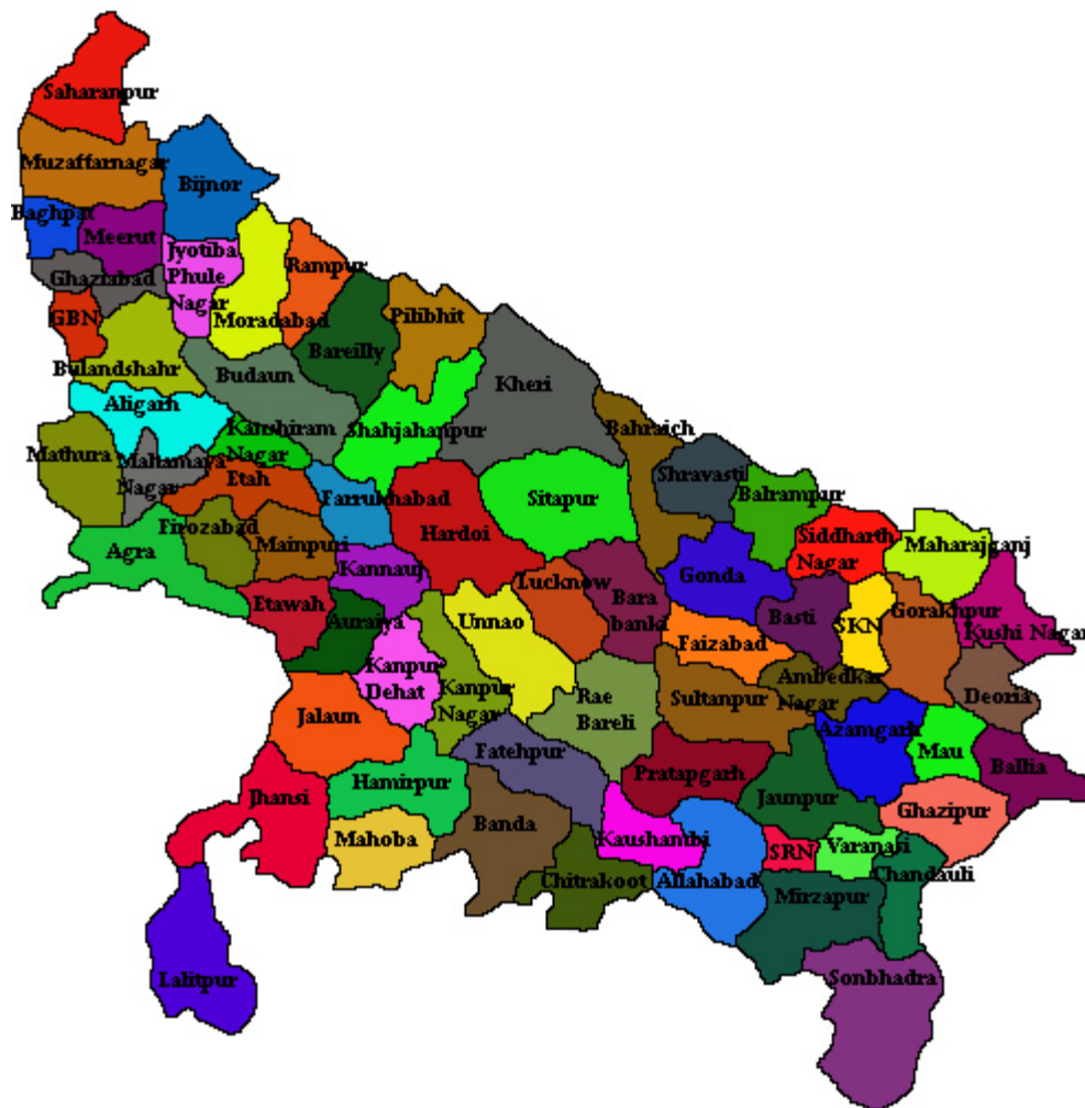
Annexure 01: Location map of the Uttar Pradesh state and district Jalaun