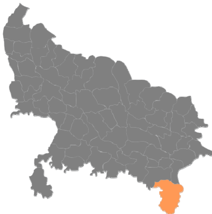
Annexure-1: Location map of Sonbhadra district within State